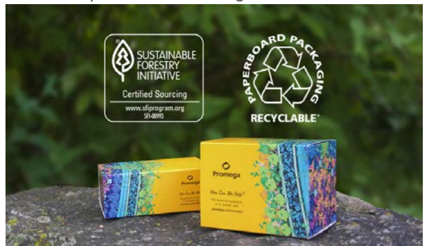
Our sustainable, environmentally-friendly packaging.

The SFI label indicates a commitment to tracking fiber, from forest content to end product, using a third-party internationally-recognized sustainability standard. In addition, the ink, coating and glue are sourced from renewable products containing no controversial materials.