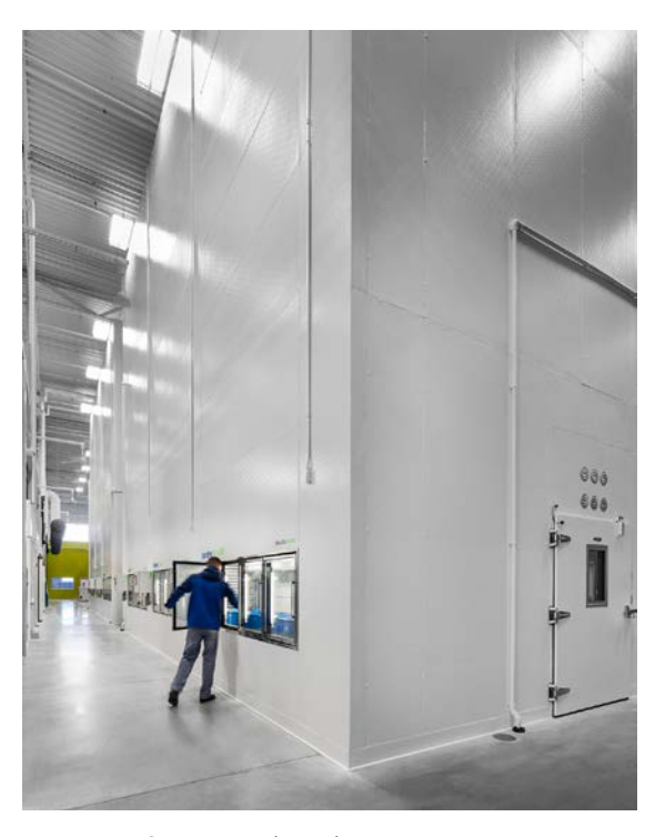
Vertical LIft Module (VLM) storage and retrieval system.

In addition to our standard equipment, we utilize the automated storage and retrieval system (VLM or Vertical Lift Modules) which allow for 400lb-capacity, high-density vertical storage up to 35-feet high.