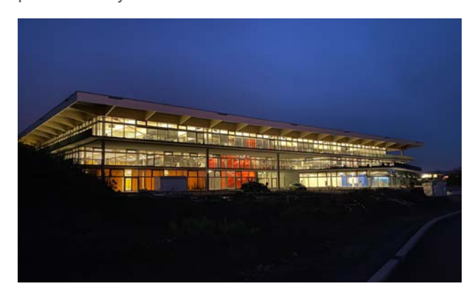
One of the new distribution facilities in Walldorf, Germany.

Promega also has two regional distribution centers in Germany (Euro hub) and Singapore, as well as smaller local distribution centers in the United Kingdom, South Korea, China, Australia, Japan, India and Brazil. Promega maintains the inventory stock for local order processing at these sites, ensuring timely global delivery of our products to you.