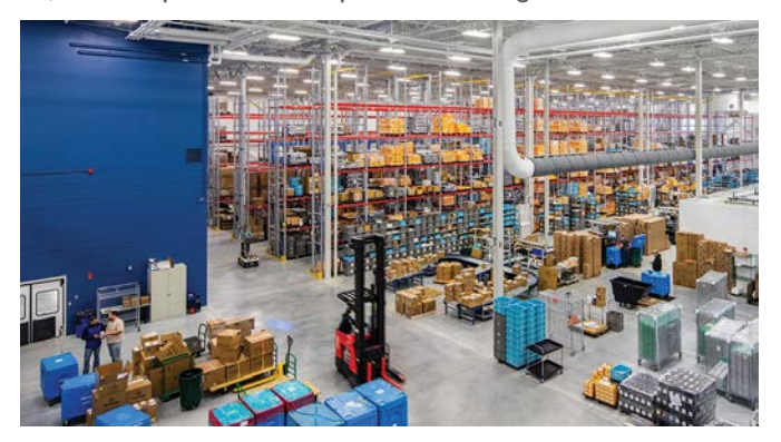
A look at the inside of the Kepler Center.

The Kepler Center houses our state-of-the-art warehouse with ample capacity for ambient, +4°C, -20°C, -70°C and -140°C cryostorage space. This includes 1,000 square feet of +4°C storage, 7,500 square feet of -20°C storage and 21,000 unique individual product storage locations.