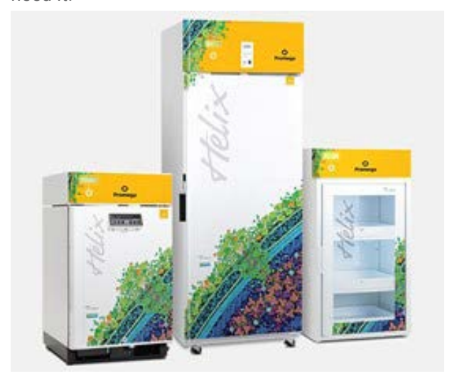
Examples of some different Helix® units.

We utilize state-of-the-art RFID technology to provide convenient on-site stocking. Our inventory management system ensures you have what you need, when you need it.