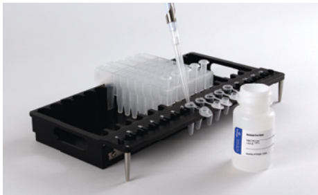
Figure 2. Setup and configuration of the deck tray(s). Elution Buffer is added to the elution tubes as shown. Plungers are in well #8 of the cartridge.