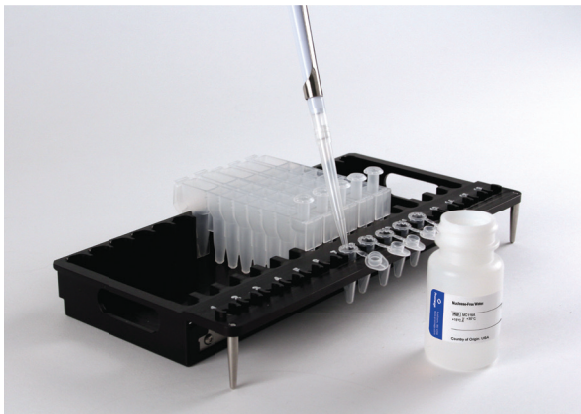
Figure 2. Setup and configuration of the deck trays. Nuclease-Free Water is added to the elution tubes as shown. Plungers are in well #8 of the cartridge.